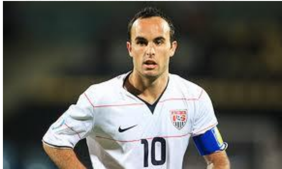
Landon Donovan US Men's National Soccer Team